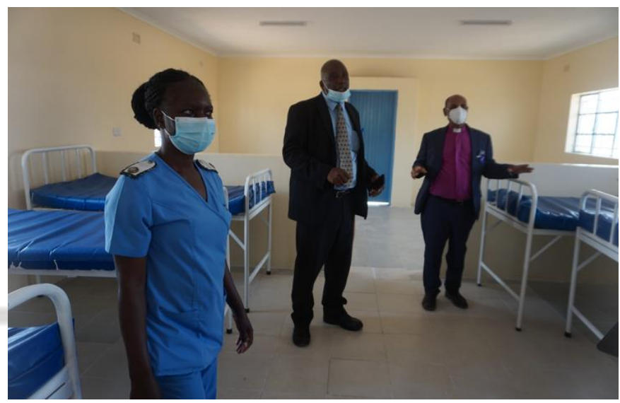
Touring the institution – Waiting Mother's shelter