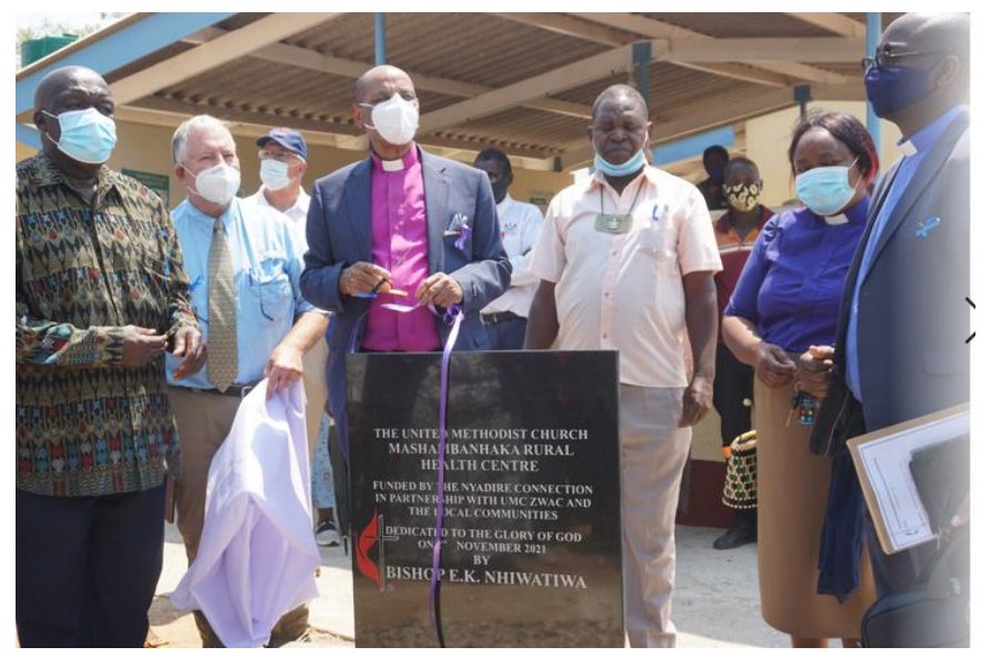
Reading of the script by Sr in Charge

This year 2021, they are celebrating 15 years of great work in Zimbabwe hence many people converged at the venue.