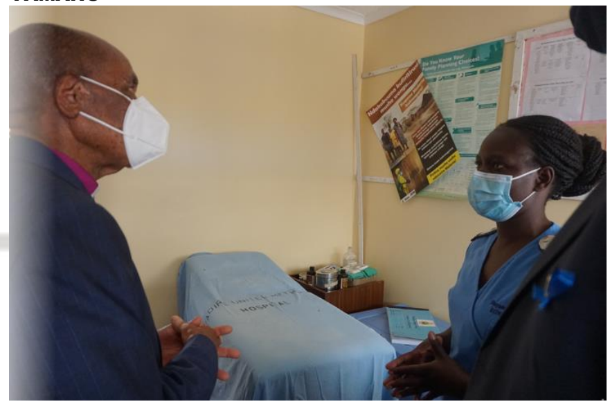
Touring of the institutions – Consultation room