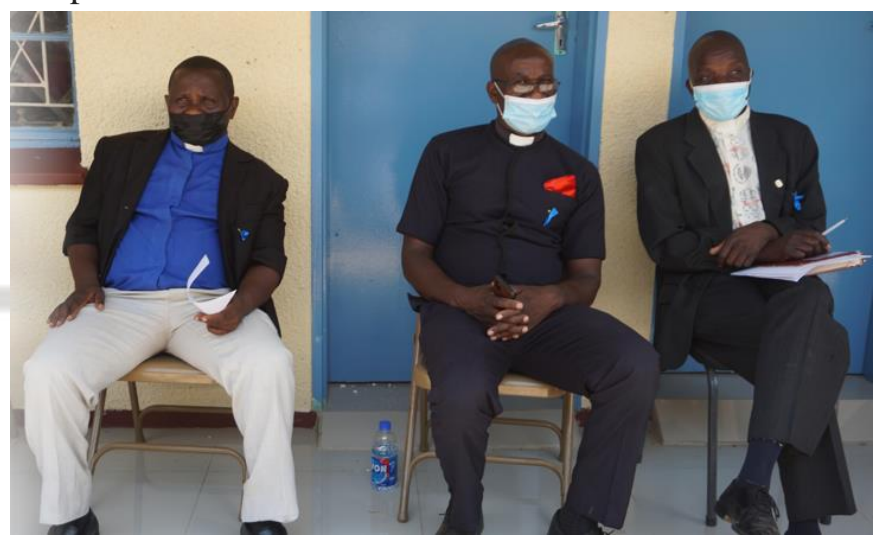
The clergy members

He said that he cannot lose sleep if there is a challenge because these leaders are the best to approach and solve our problems.