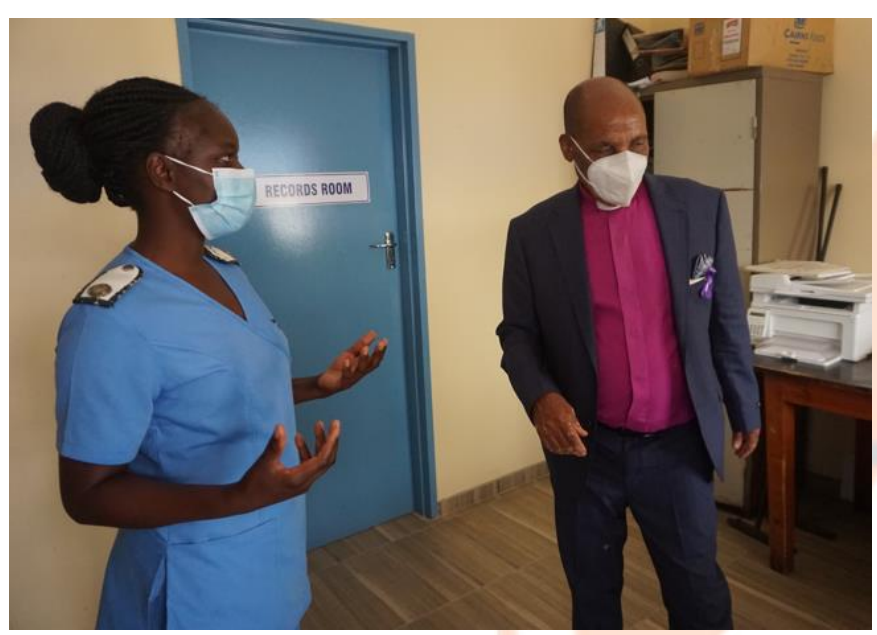
Touring of the institution – record room