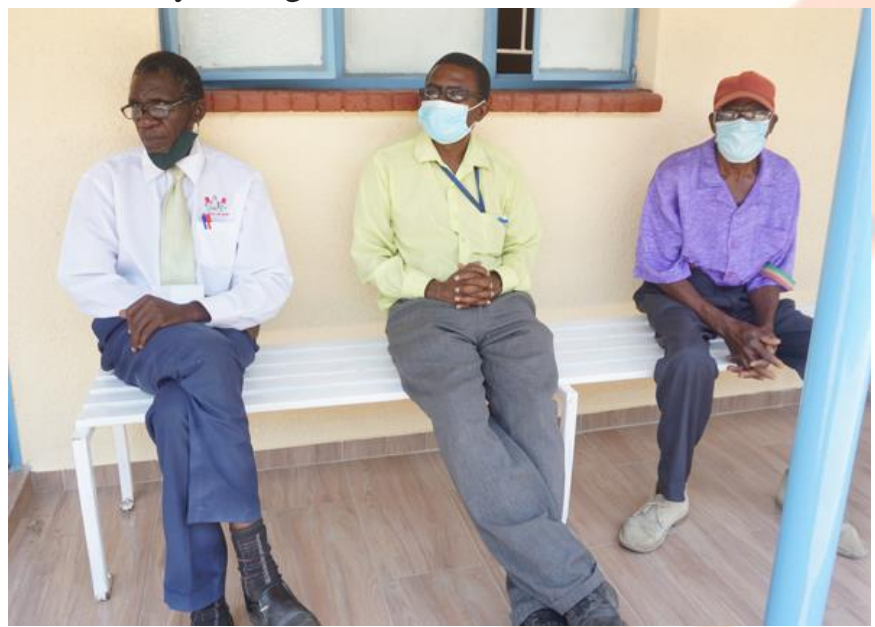
The community members

He said that if you see people coming from another countries interacting with our leaders, the chiefs, Member of Parliament, and church members it means there is strong connectivity amongst them.