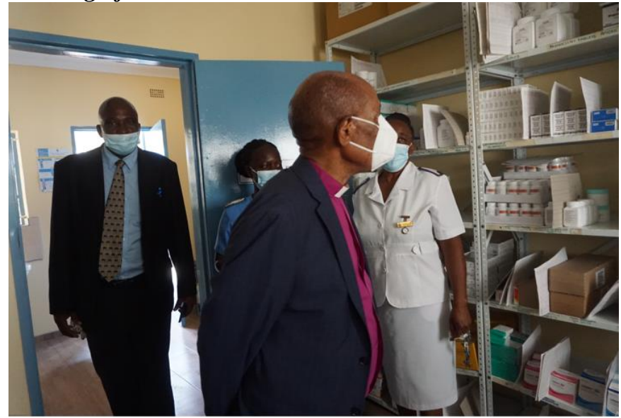
Touring of the institution – Drug room

"THEREFORE GO..." (Matthew 28:19-20) Page 22 of 24