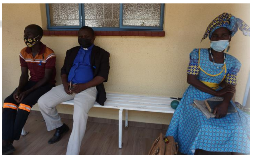
The clergy and the community members

"Development cannot take place where there is disunity. There would be pulling down of each other," adding that for this district they speak the same language hence there is need to thank them all.