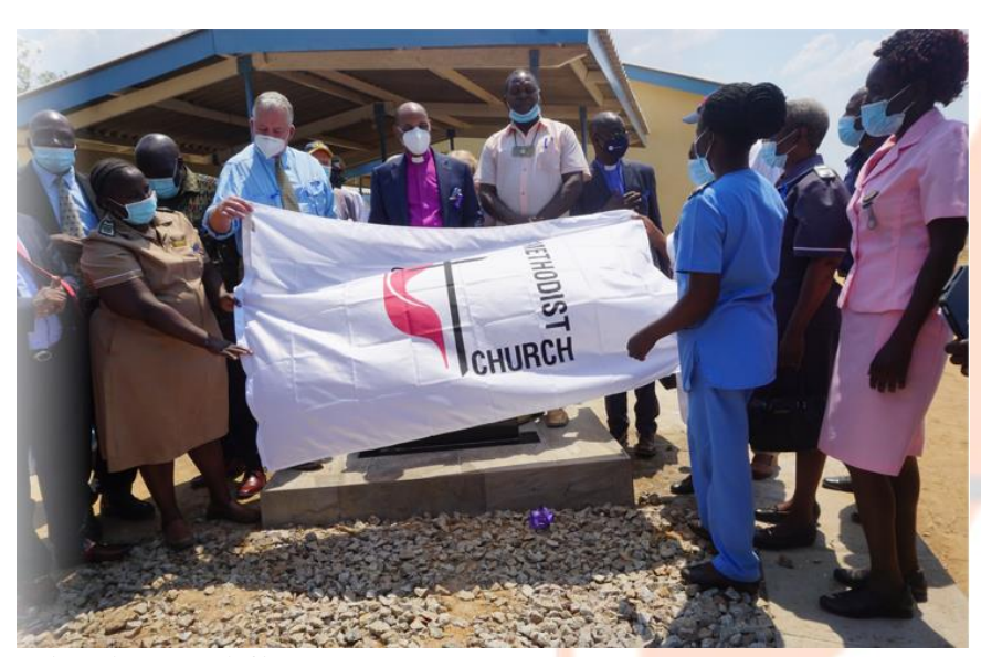
The donated flag