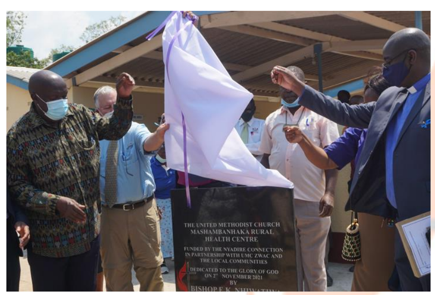
Removing of the cover