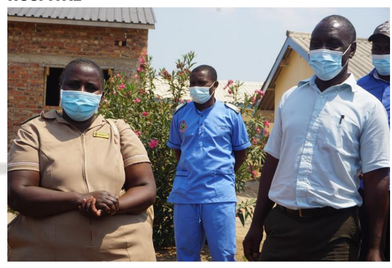
Team from Mutawatawa hospital