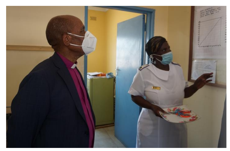
Explaining the records

"THEREFORE GO..." (Matthew 28:19-20) Page 26 of 33