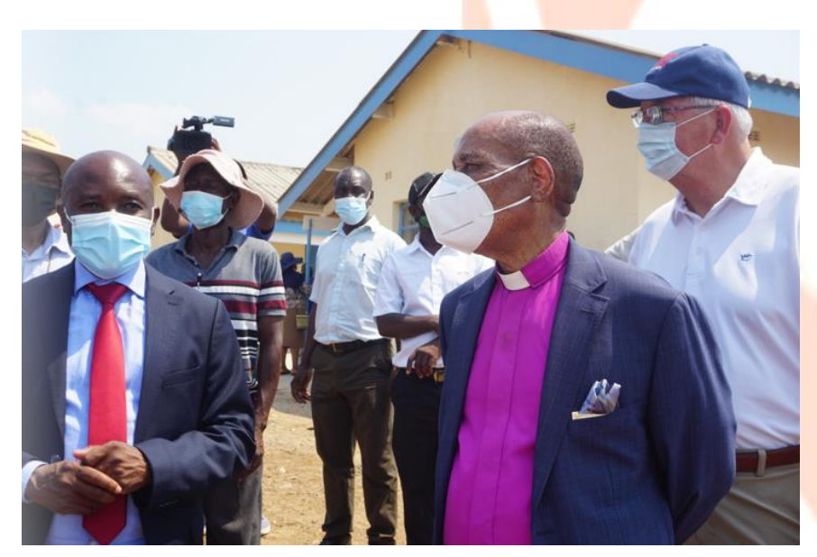
Touring the building