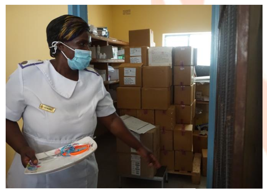
Drug room to be a dispensary room soon.