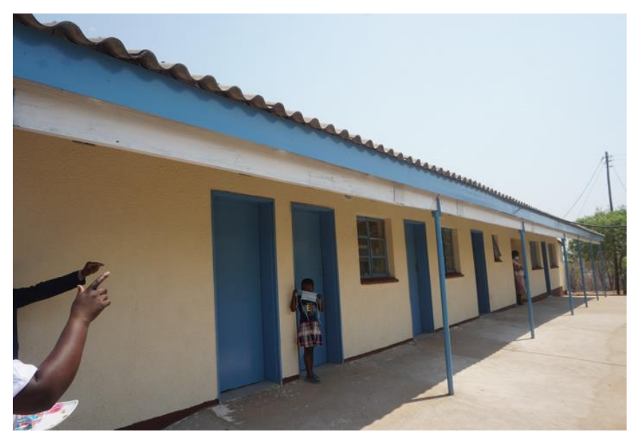
Waiting mothers shelter.

"THEREFORE GO..." (Matthew 28:19-20) Page 27 of 33