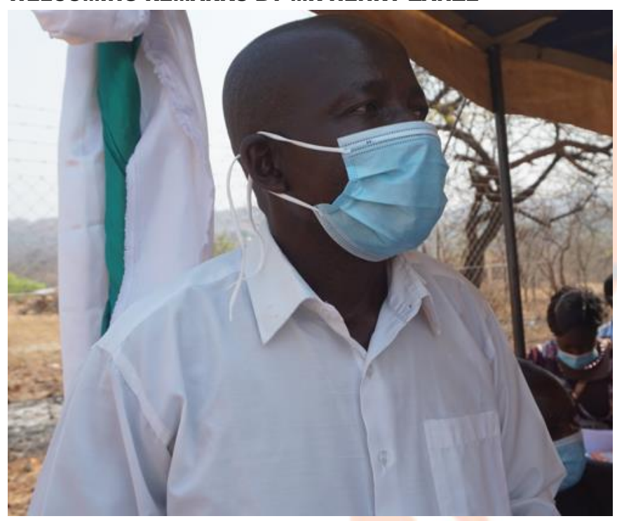
Mr Zanze welcomed the following: