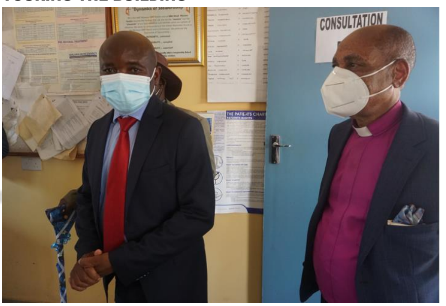
In the consultation room – The Bishop and the MP