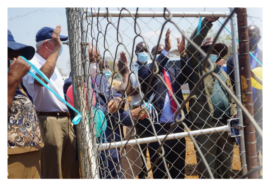
Cutting of the ribbon.

"THEREFORE GO..." (Matthew 28:19-20) Page 29 of 33