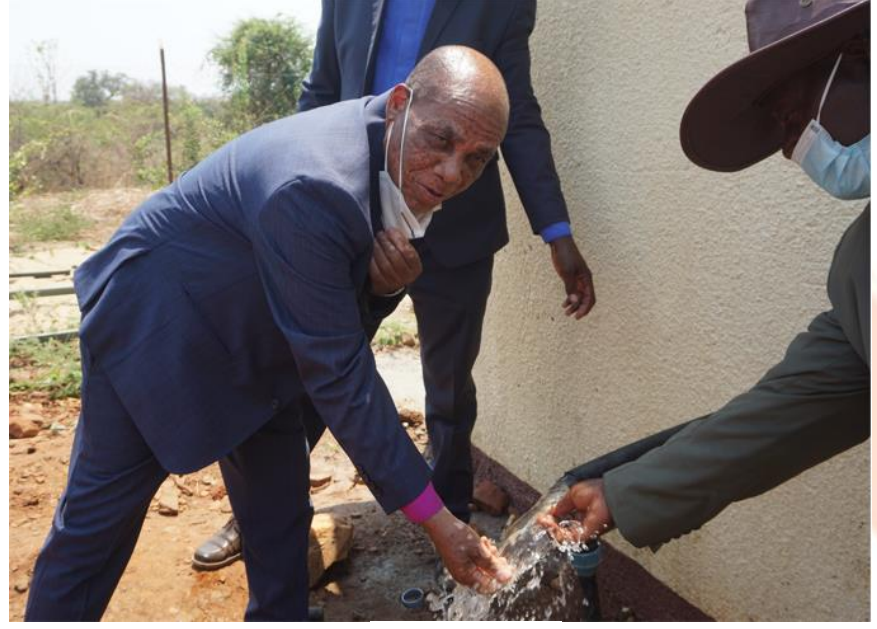
Gushing of water from the borehole