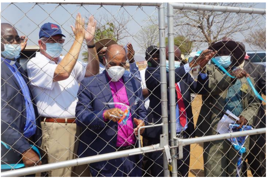
Celebrations after cutting of the ribbon