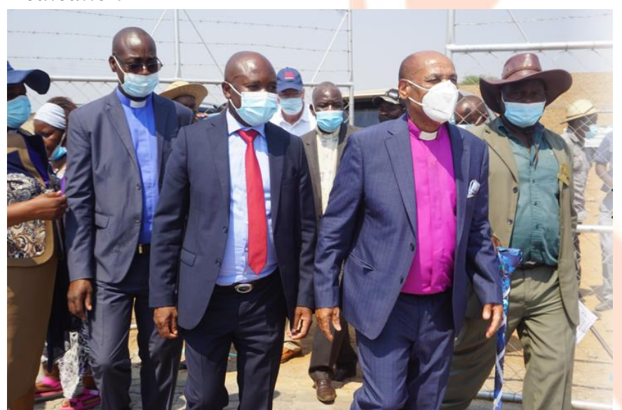
Touring the buildings