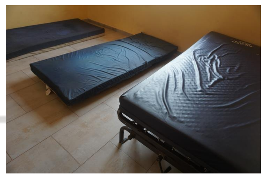
Labour ward and postnatal.