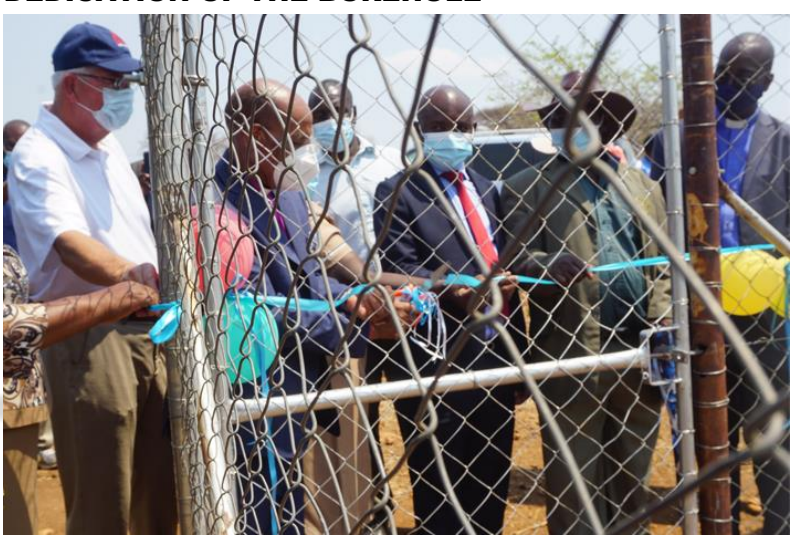
Cutting of the ribbon