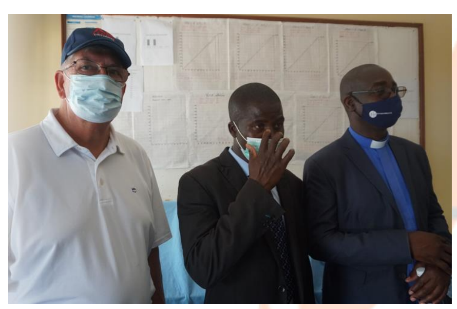
People present during the tour