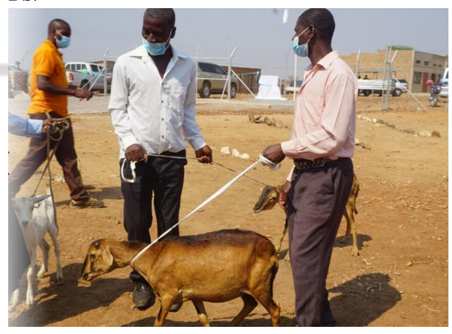
Gifts for the Bishop, MP and Chief

The clinic brought a goat and two sheep. Chief was given a sheep as well as the bishop and a goat was given to the DS.